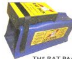
THE RAT PACK & THE RATZAPPER

You can switch between "AA" and "D" cell batteries any time you want!