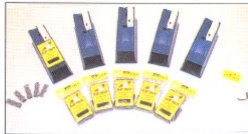
THE RAT ZAPPER BATTLE STATION!

We also sell a "Battle Station" system. This mega power tool kit for rodent control commonly consists of (5) five Rat Zapper units, each with a transmitter which sends a wireless signal to a Monitoring Panel when the trap is fired. We will soon be able to send a message to your cellular phone or pager when one of the Zappers has done its job!