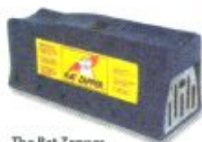
The Rat Zapper

Once you are confident that you are on target, then you need to properly bait the Rat Zapper. Dry pet food has been carefully researched, and we have found it to be a very effective lure for rodents. You may use any dry bait that works ... it won't hurt our feelings! Dry dog or cat food should work very well. Please don't "glop" any moist bait in your brand new Rat Zapper because it may cause a "false tripping" and you won't get Mr. Mouse or Mr. Rat as quickly as you wish. Goopy oil-based "yummy rodent tummy pleasers" like Peanut Butter should be placed in a plastic container (e.g. bottle cap) at the back of the trap.